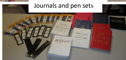
Journals and pen sets