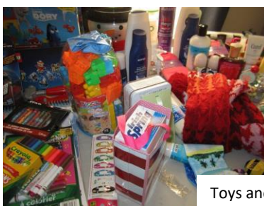
Toys and so much more