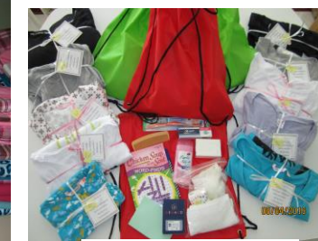
Hygiene kits and PJs