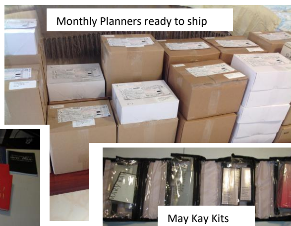
Monthly Planners ready to ship