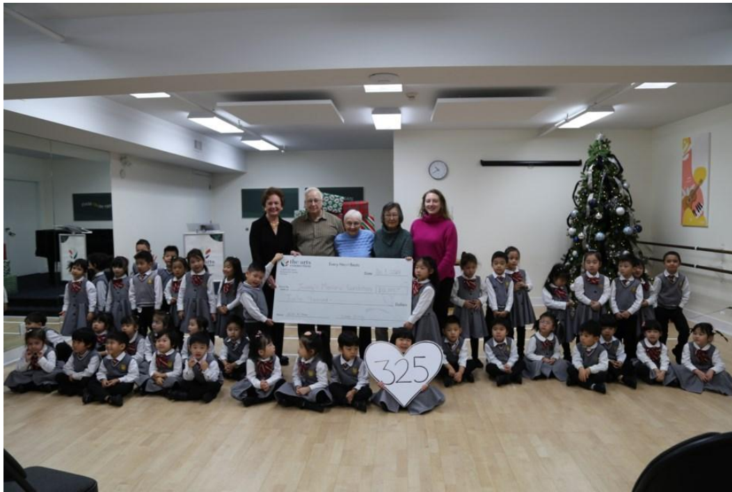
Students and staff at The Arts Connection, along with community partners, raised $12,000 and 325 pairs of pyjamas to help women and children facing domestic violence.

A school's PJ Drive honours an early childhood educator's legacy.